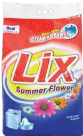
Extra Summer Flower

Size 65g | 150g | 300g | 500g 1kg | 3kg | 4kg | 5kg | 10kg Bucket 4.5kg | 9kg | 12kg