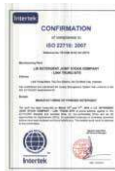
ISO 22716: 2017