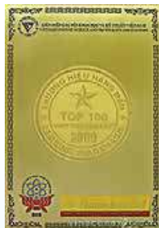
Top 100 Viet Trademark 2009