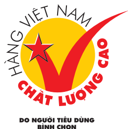
Vietnam High Quality Goods