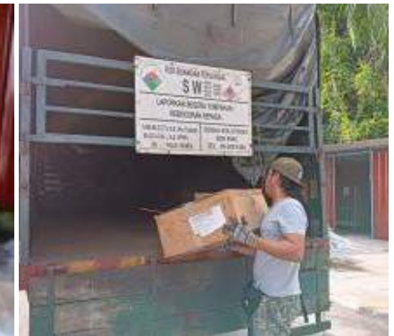
Work with Licensed Contractor for waste disposal