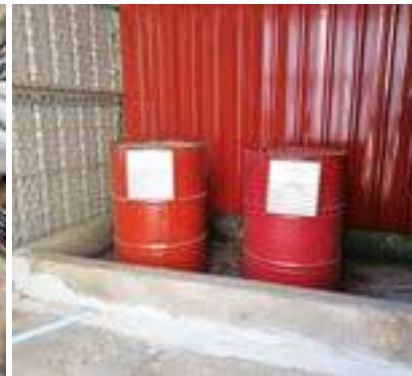
Spent lubricating Oil