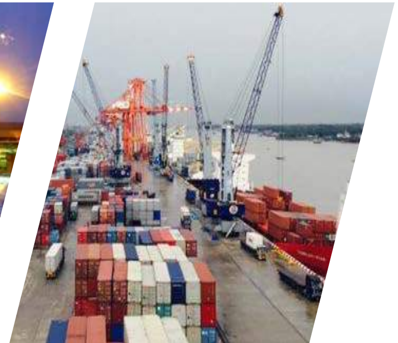
45 min drive from Yangon Port