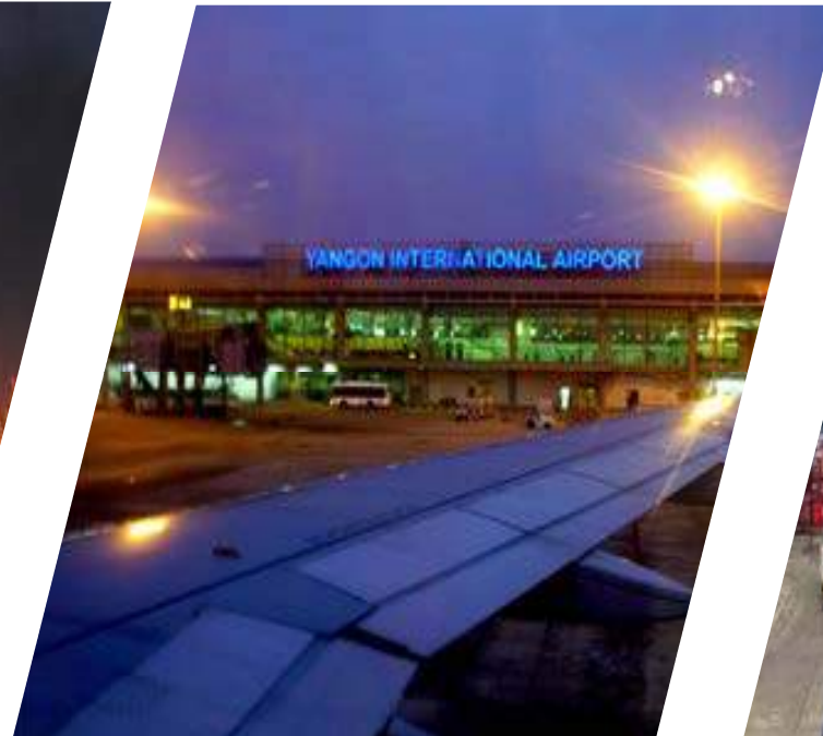
45 min drive from Yangon International Airport