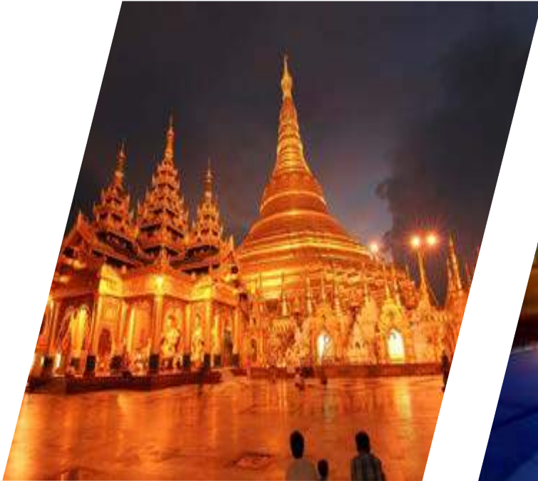
30 min drive from Yangon City