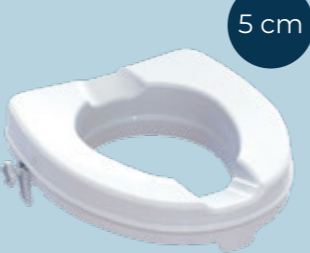
KING-5-00KN Raised Toilet Seat with Lateral Locking System 5 cm / 2"