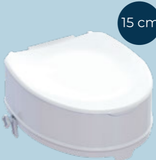
KING-15L-00KN Raised Toilet Seat with Lateral Locking System & Lid - 15 cm / 6"