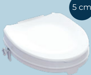
KING-5L-00KN Raised Toilet Seat with Lateral Locking System & Lid - 5 cm / 2"