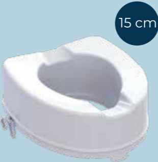
KING-15-00KN Raised Toilet Seat with Lateral Locking System 15 cm / 6"