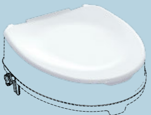
KING-L-00KN Lid for Raised Toilet Seat with Lateral Locking System