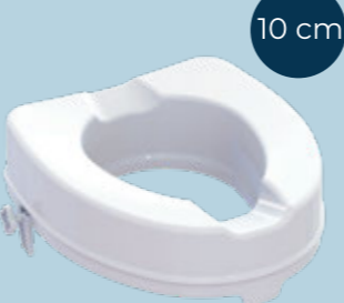
KING-10-00KN Raised Toilet Seat with Lateral Locking System 10 cm / 4"