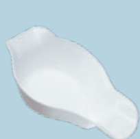
KING-BDT-00KN Bidet for Raised Toilet Seat with Lateral Locking System