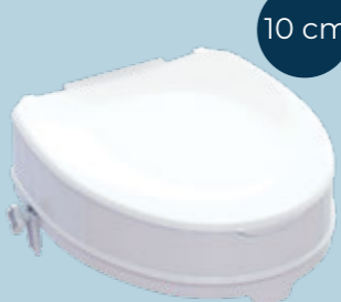
KING-10L-00KN Raised Toilet Seat with Lateral Locking System & Lid - 10 cm / 4"